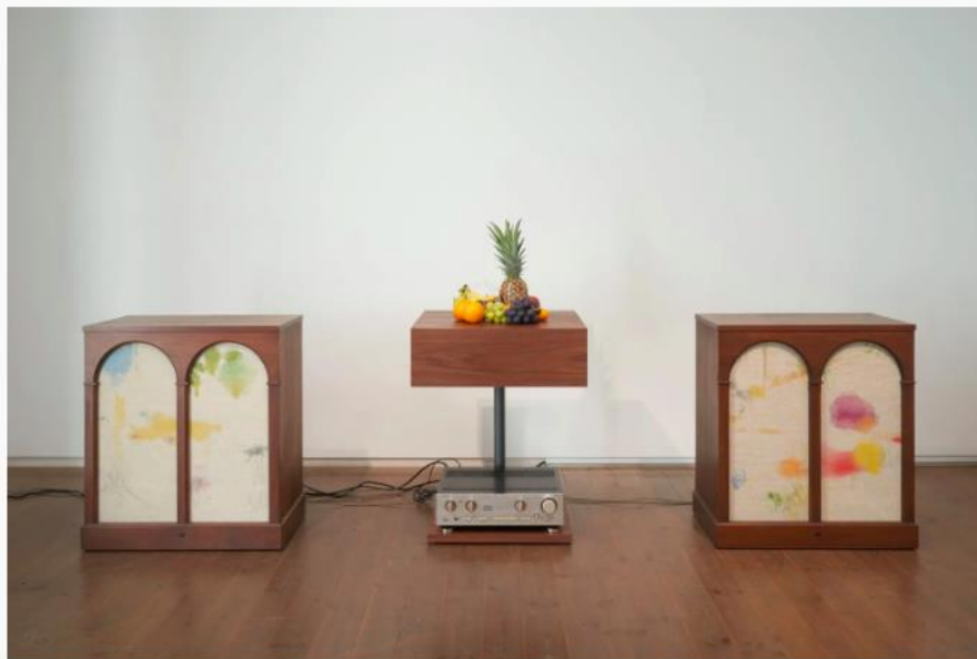
Decomposition "Neue Fruchtige Tanzmusik" Exhibition View, 2022, Courtesy of the artist, Yutaka Kikutake Gallery, Tokyo, Project Fulfill Art Space, Taipei and Mother's Tankstation Ltd., Dublin/London