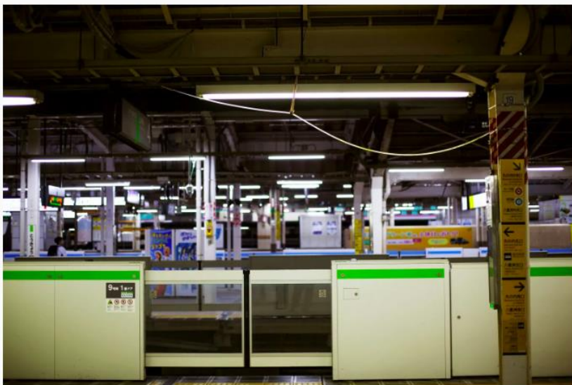
Moré Moré Tokyo #49 2021 / 2022