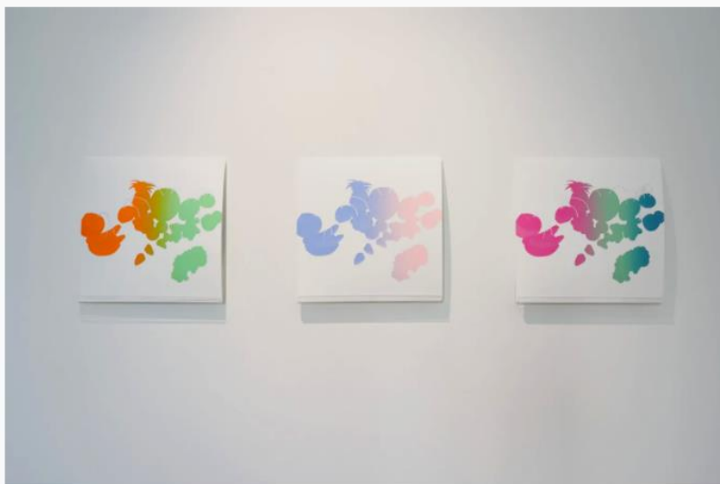
Neue Fruchtige Tanzmusik (Vinyl) #1-3 "Neue Fruchtige Tanzmusik" Exhibition View 2022年, Yutaka Kikutake Gallery, Tokyo